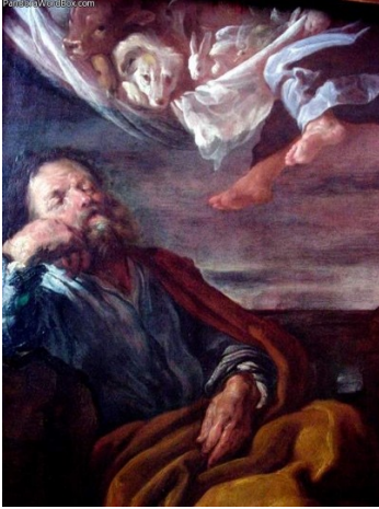
Petrus von den unreinen Tieren Vision of Saint Peter