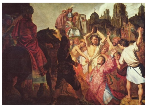
Rembrandt Harmensz. Van Rijn The Stoning of St. Stephen