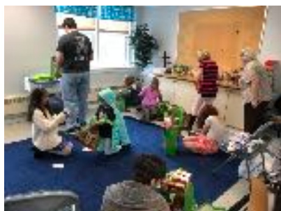
Youth Preparing Thanksgiving Dinner Boxes