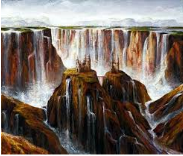
Akiane Kramarik – Possibilities Painted at Age 15