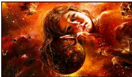
Akiane Kramarik – Faithfulness Painted at Age 16