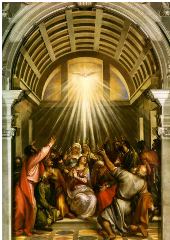
Pentecost by Titian, c. 1545

This week, ask God to help you make family a priority!