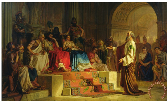
Trial of the Apostle Paul By Nikolai K Bodarevski