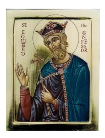
... 'Weep not, I shall not die; and as I leave the land of the dying, I trust to see the blessings of the Lord in the land of the living.'